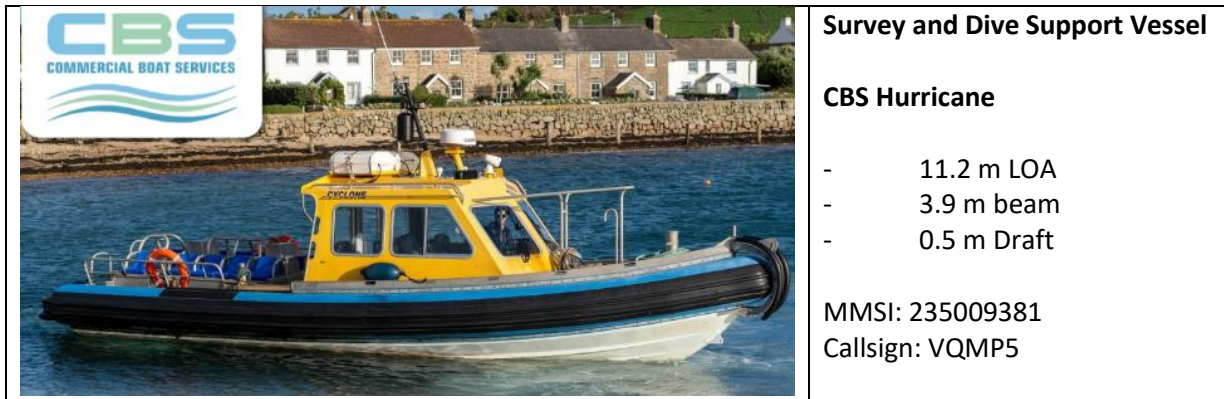
Figure 2 - Vessel Specification