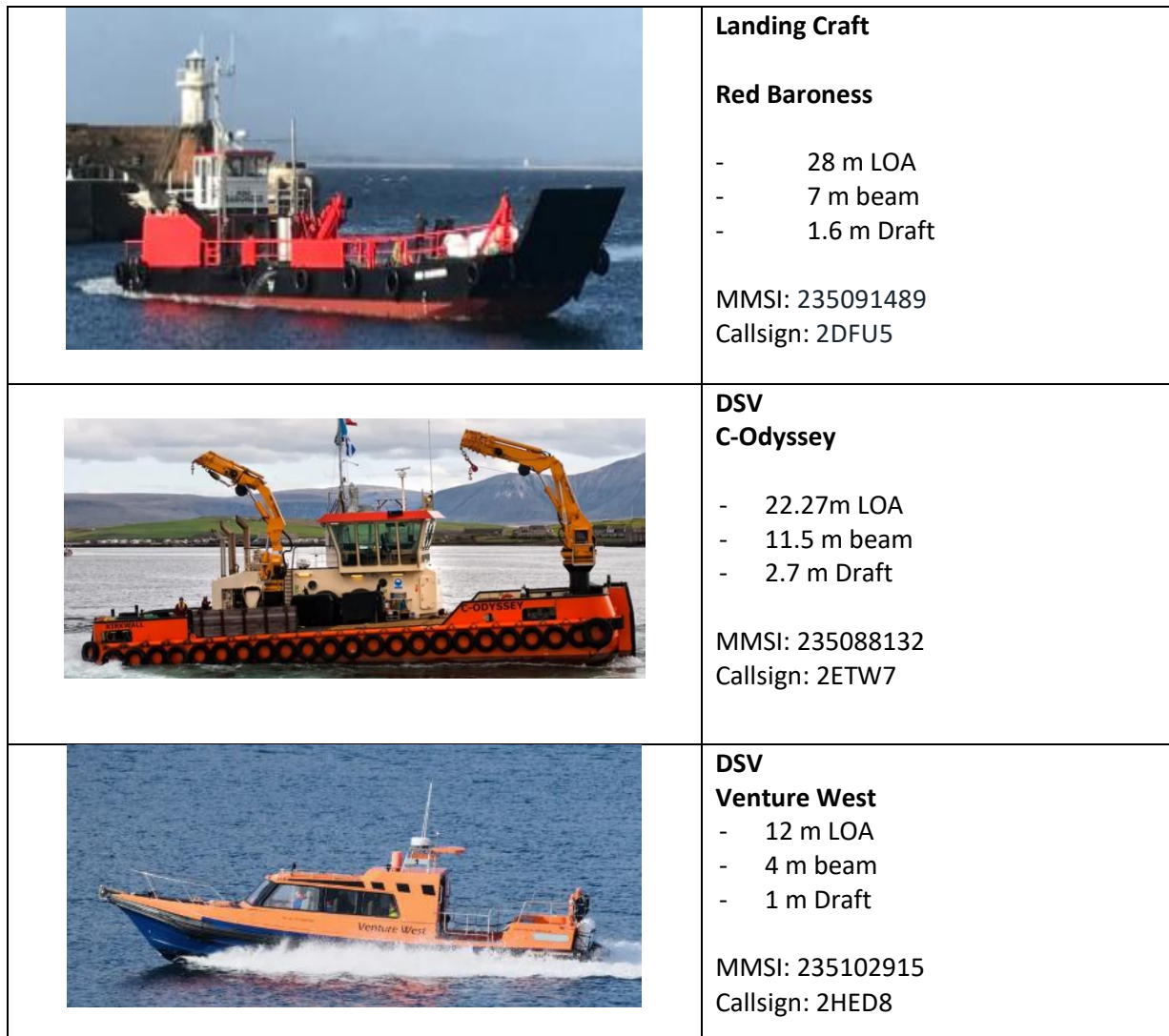
Figure 2 - Vessel Specification