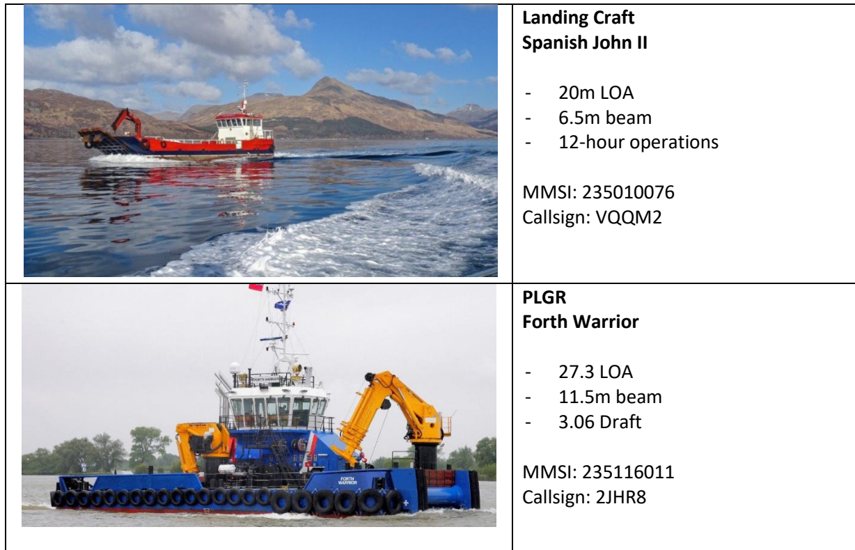
Table 2 - Vessel Specification