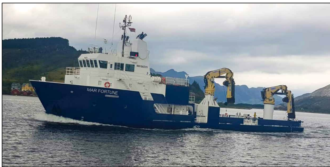
Figure 4: Vessel – Mar Fortune

Call Sign LEZI MMSI Number 257011630 IMO 9267273