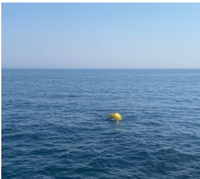
Figure 3: Datawell Waverider as deployed.

The two wavebuoys deployed (Figure 3) will be yellow spherical buoys, each measuring 1.1 m diameter, and fitted with a flashing antenna with sequence Fl (5) Y 20s.